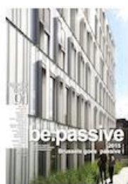
special issue #01 Brussels goes passive !