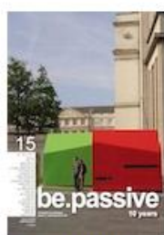
be.passive #15 - 10 years