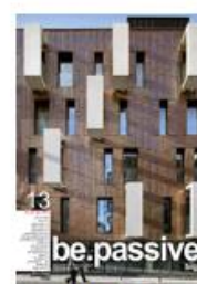
be.passive #13 - big

Since November 2009, PMP and PHP have been issuing “ Be Passive ”, a quarterly magazine dedicated entirely to low-energy building, and the passive standard in particular. The target audience is: architects, the public authorities, building societies, regional development agencies, engineers, construction manufacturers, real estate actors and all others involved in construction. The magazine aims to serve as a “one-stop shopping” center for all that relates to energy-efficient building. The goal is to present the information