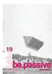
be.passive #19 - what else?

The Ice Challenge event was organized by PHP in Brussels and Antwerp. It aimed to raise public awareness and illustrate firsthand the benefits of the good building insulation. The event consisted of placing two 1,3 tone blocks of ice in two separate makeshift constructions – one very well insulated, and the other one – not insulated. The two constructions are placed side by side on a main downtown street for everyone to see. The goal is to illustrate in this way how more rapidly the ice in the non-insulated construction melts during the summer months. Observers have to guess how much ice would be left in each shack after 40 days. For example, during the 2007 Ice Challenge, more than 450,000 kilograms of ice still remained in the well-insulated cabin, whereas the ice in the non-insulated one had completely melted for 11 days only. But the main objective of the event is promotional: by the guessing competition, the participants obtain useful tips for energy saving and house insulation.