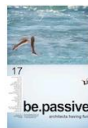
be.passive #17 - architects having fun