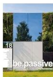
be.passive #18 - no nonsense