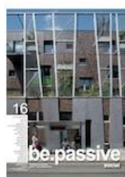
be.passive #16 - social