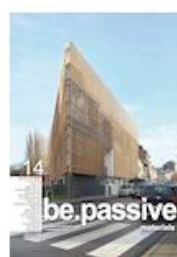
be.passive #14 - materials